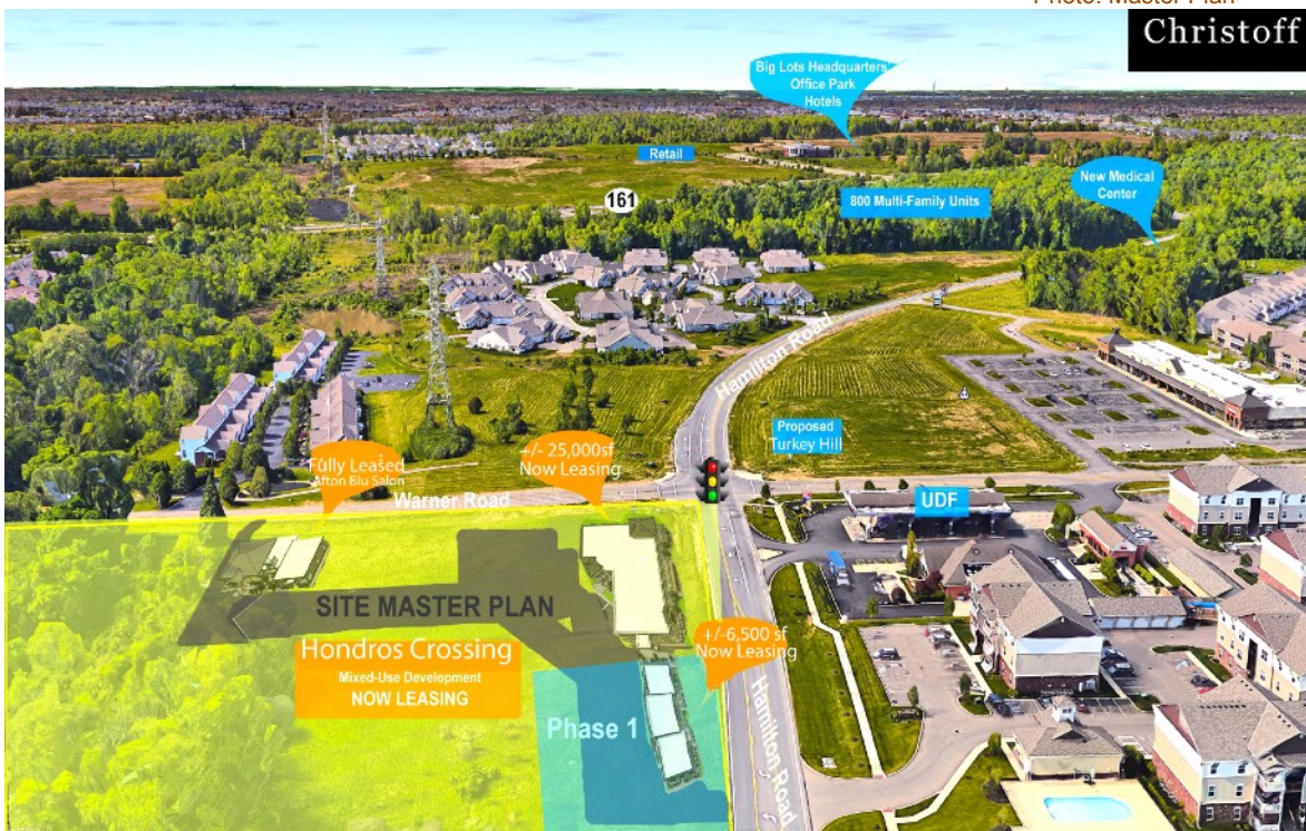
Photo: Master Plan

Westerville, Ohio 43081 (Franklin County)